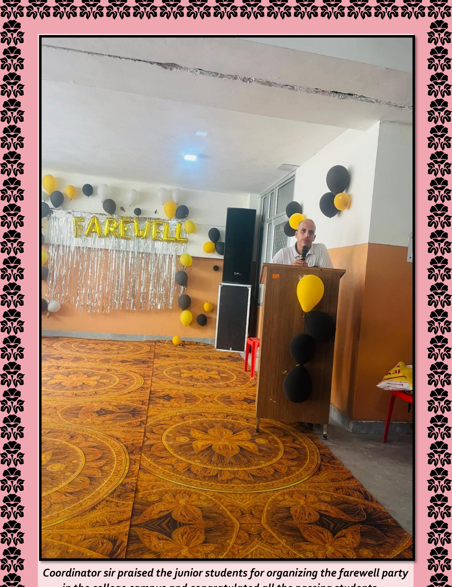
in the college campus and congratulated all the passing students.