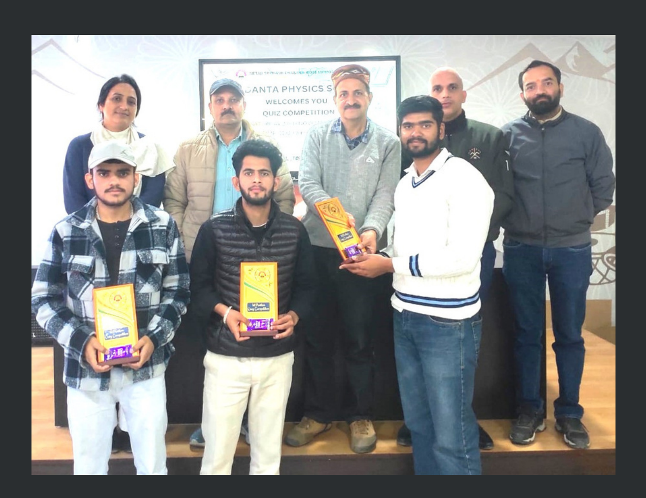
ıst Prize--Team C