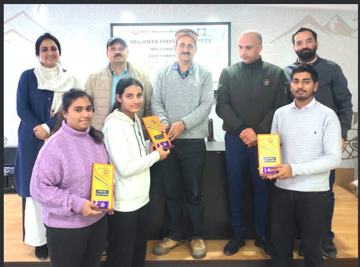
2nd Prize--Team E