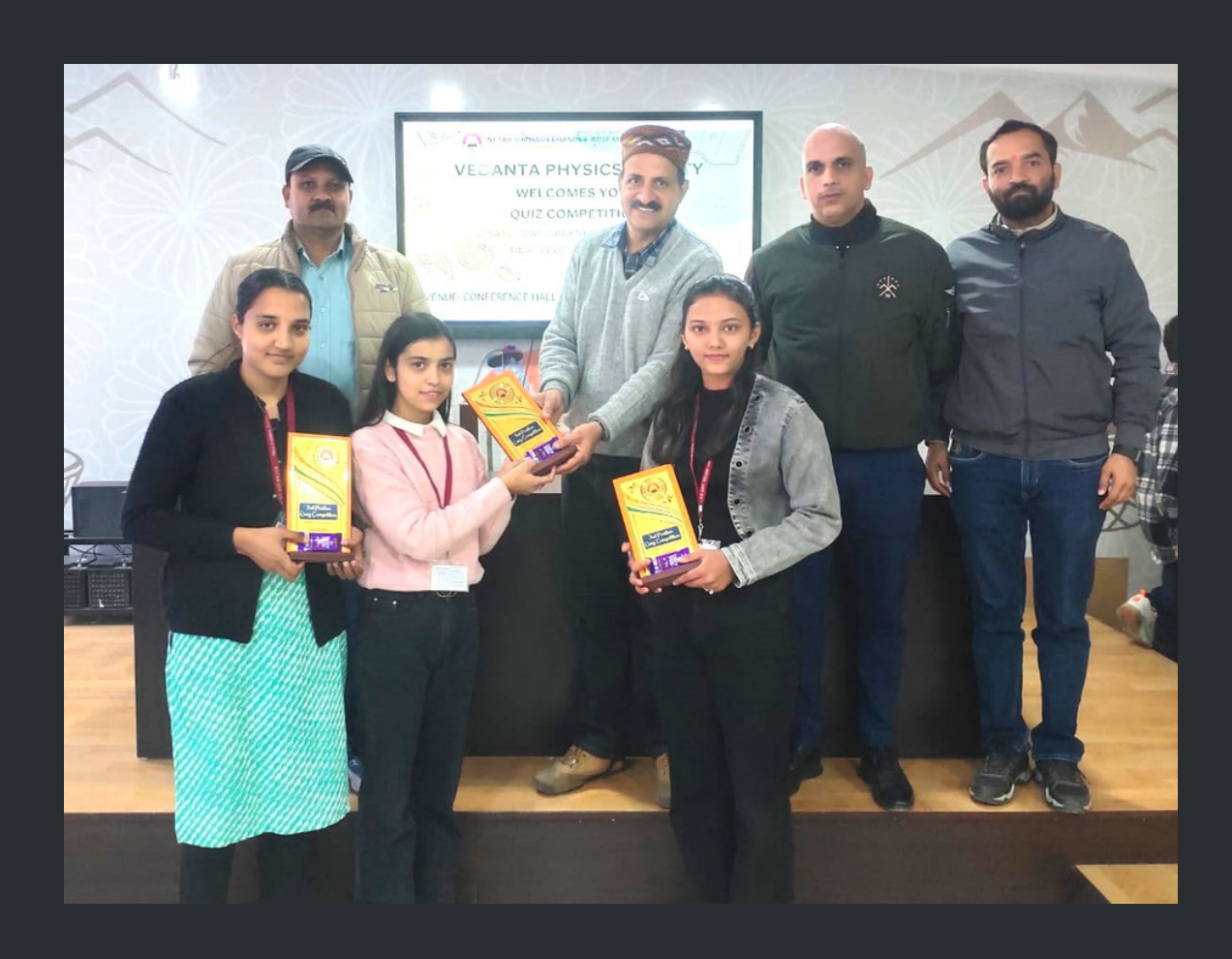
3rd Prize-- Team F