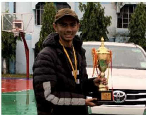
4.Kartikey chandel DRAW seeker HATES Petrov's Defence