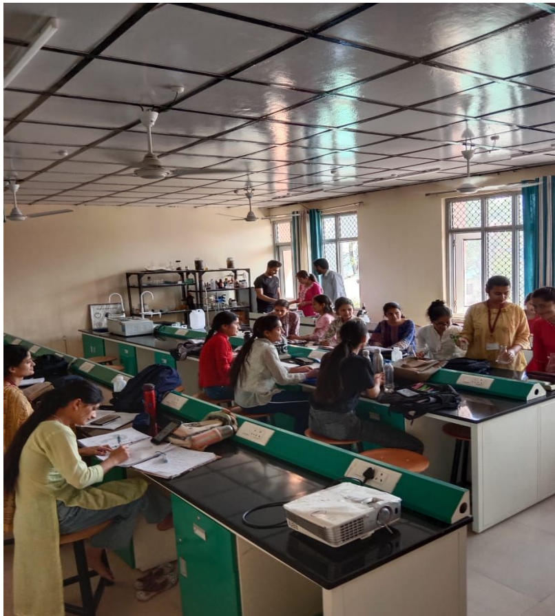
P.G. LAB I