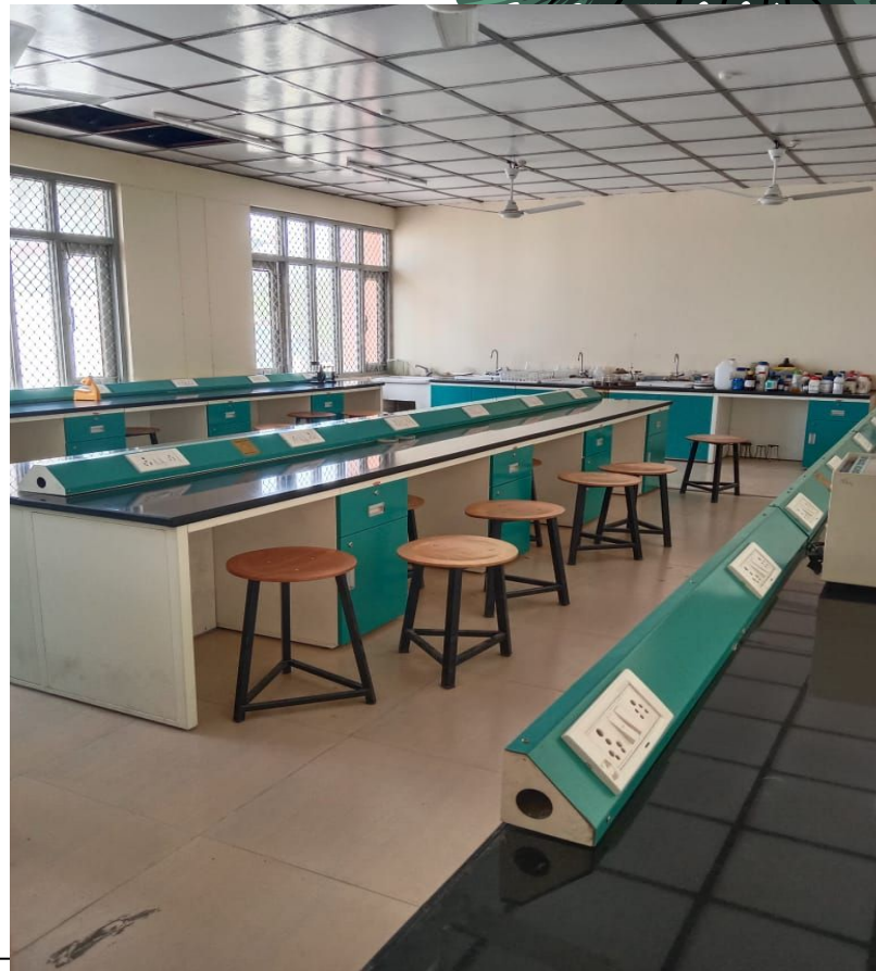
P.G. LAB II