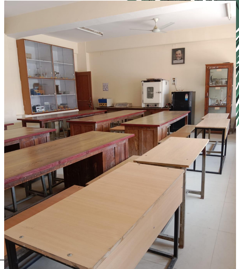
UG LAB II