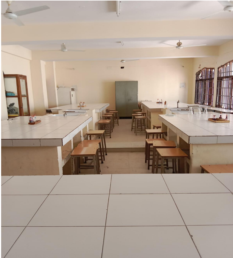
U.G. LAB I